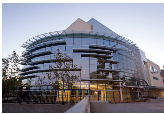
Student Academic Services Building Moreno Valley College