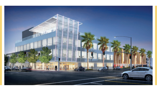
Riverside City Culinary Arts Academy and District Offices - Centennial Plaza

Riverside Community College District Citizens' Bond Oversight Committee