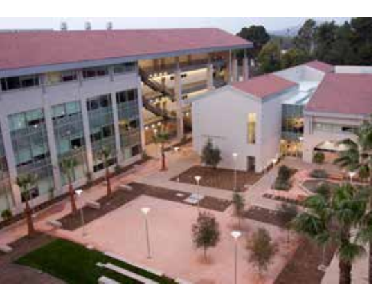
School of Nursing and Science/Math Building -Riverside City College