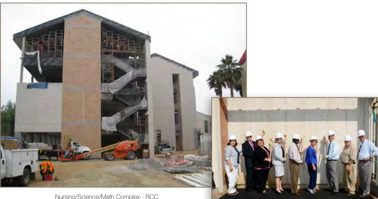
Nursing/Science/Math Complex - RCC