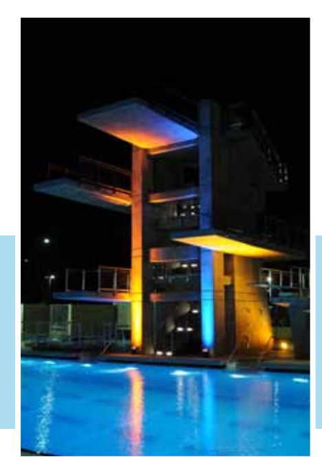
Riverside Aquatics Complex