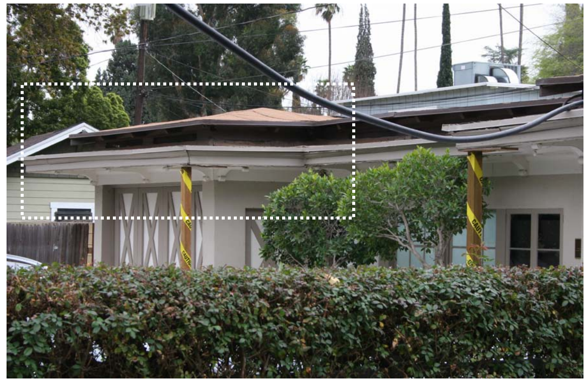
Broeske Architects & Associates, Inc. Alumni House Garage Restoration Project