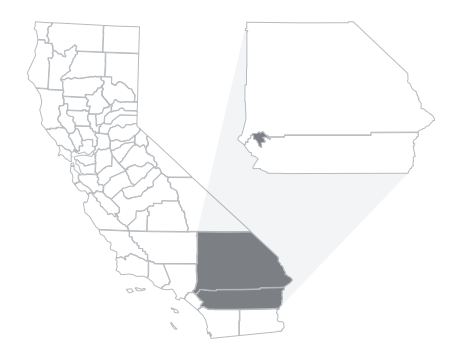
THE RCC SERVICE AREA, SAN BERNARDINO AND RIVERSIDE COUNTIES, CA

RCC influences both the lives of its students and the regional economy.