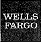
(Red box with gold letters)