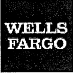
(Black box with white letters)