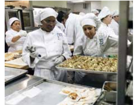
Riverside City College Culinary Academy