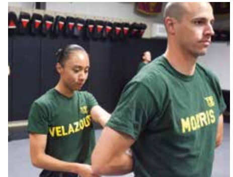
Ben Clark Training Center