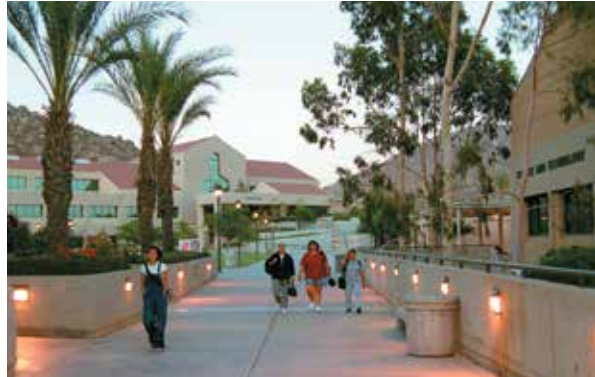
Moreno Valley College (est. 1991)