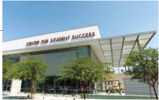
Norco College (est. 1991)

The quality of information contained in nomination and support letters is given particular attention by the committee. Letters that comment on the individual's specific achievements are the most important and helpful. Nominators and supporters should answer the following general questions in addition to the ones specified for each award category: