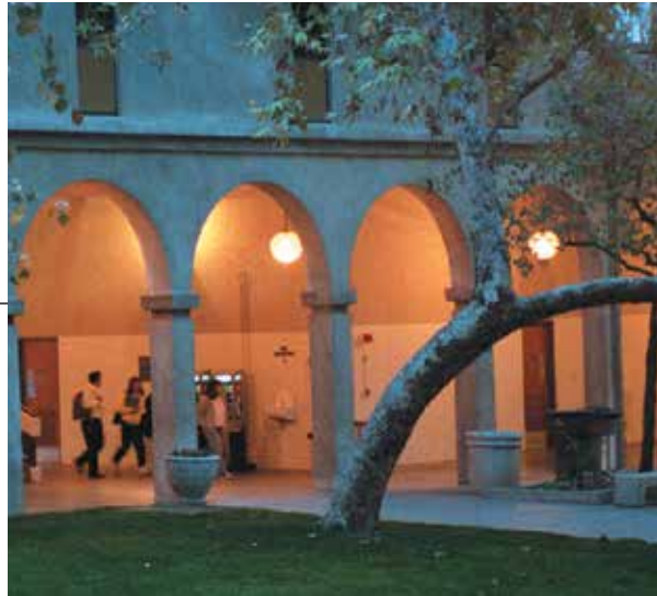
Riverside City College (est. 1916)

In Spring 2016, the District family and community will gather in celebration to recognize the award recipients. Specific criteria for each award are presented in this brochure.